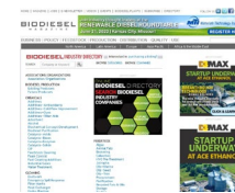
Bonus: Medium Rectangle Online Ad

BONUS: Receive 1 year FREE medium rectangle ad on Directory.BiodieselMagazine.com with the purchase of a display ad. Size: 300 w x 250 h pixels File Size: 40k limit Format: JPG, GIF or Animated GIF