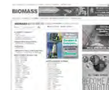
Bonus: Medium Rectangle Online Ad

BONUS: Receive 1 year FREE medium rectangle ad on Directory.BiomassMagazine.com with the purchase of a display ad.